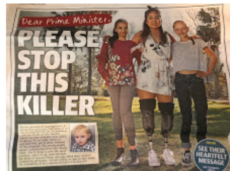
'Dear PM Please stop this killer' p1.jpg 1242K