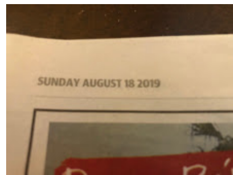
'Dear PM Please stop this killer' p4.jpg 603K