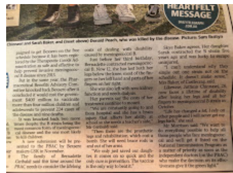
'Dear PM Please stop this killer' p3.jpg 1467K